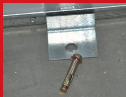
Concrete bracket & anchor $27 packet of 8