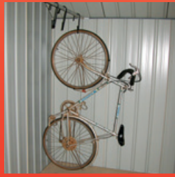
Bike hanging bar with bike hooks 1950mm Wall Height Shown