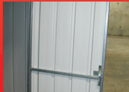
Upgrade to Steel Frame Door and Opening