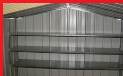
Mezzanine Shelves to suit storage gable end