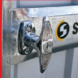
Tee Handle $45