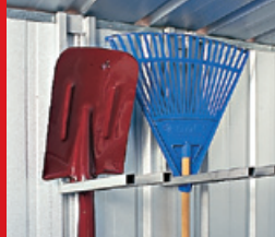
Shovel/Broom rack $33 each