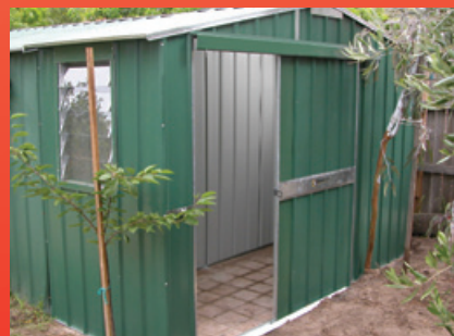
Sliding door in Gable End