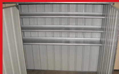
Shelves and brackets to suit storage on walls