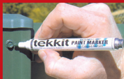
Tekkit® Touch-up Paint Pens $14 each