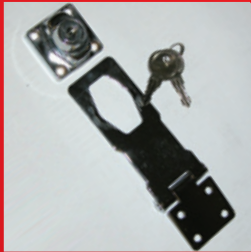
Locking Hasp and Staple $32